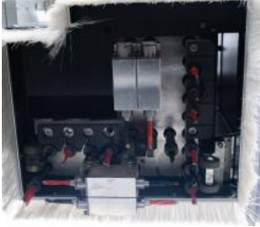
EXCITECH Top drill unit-12(V)+4(H) with saw blade x 2 SETS