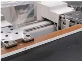
U shaped grippers are automatically positioned to accommodate different sized work pieces. Coordinating with CAM software reducing the clamping times