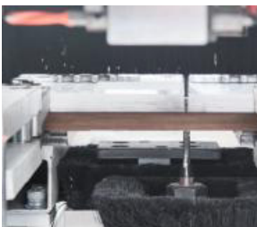
Grooving from top and bottom synchronously to improve the grooving efficiency