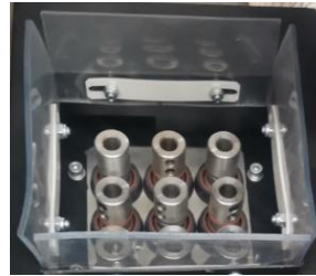
EXCITECH Bottom drill unit-V9