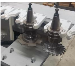
Automatic tool-change structure - 7 slot tool changer, can work with some special processing technologies, such as light trough grooving, Lamello & Modeez wood connecting elements processing