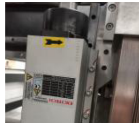
Bottom spindle: EXCITECH 3.5kw MTC spindles for grooving