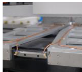
Double rail transmission side alignment realizes the precise positioning