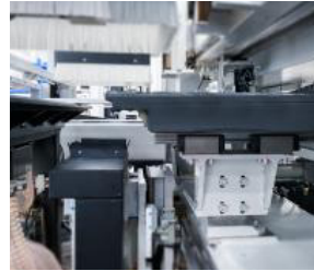
Pull-out table supports the flat moving table to ensure the processing precision