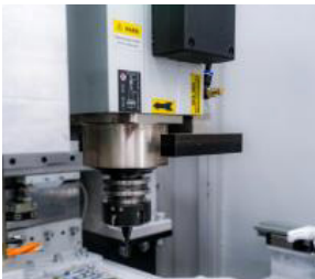
High efficiency EXCITECH 6KW ATC spindle with ISO inter-face, 18000rpm